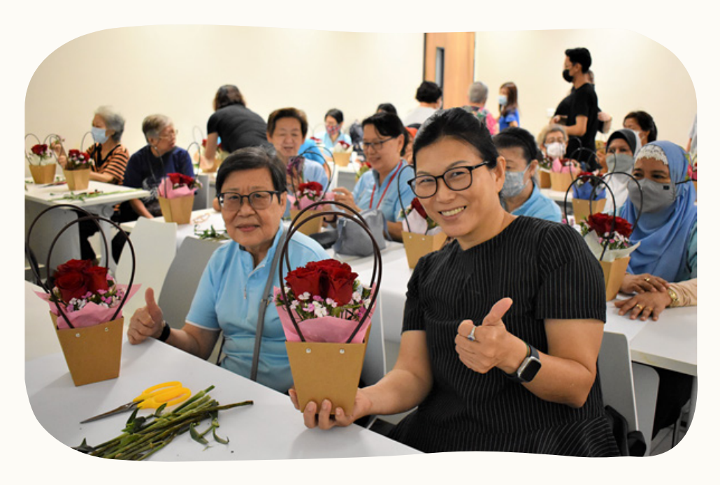
Thumbs up to the beautiful flower arrangement