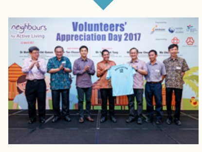
Expansion of Neighbours for Active Living Programme to the whole of South East District with the inclusion of Mountbatten division