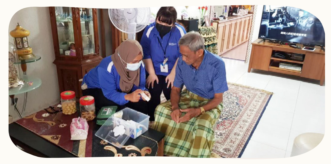
Neighbours Community Care staff delivered a first aid kit to one of our senior during home visit