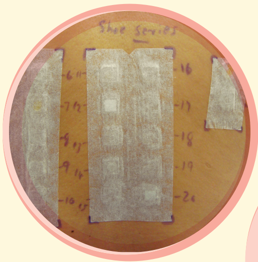
Top: Patches applied Right: Patch test reading showing some allergic reactions