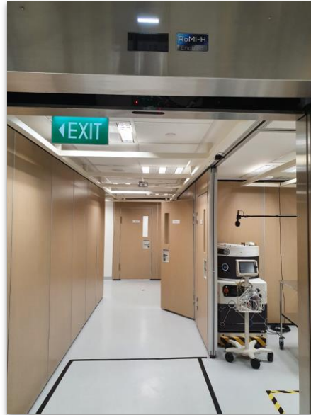
Entry to OT, Lift