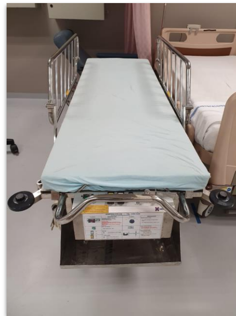
Trolley bed being wheeled into the patient ward