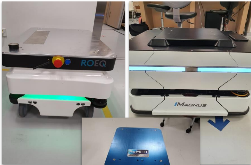
Robots performing daily tasks