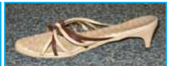
Examples of unsafe footwear